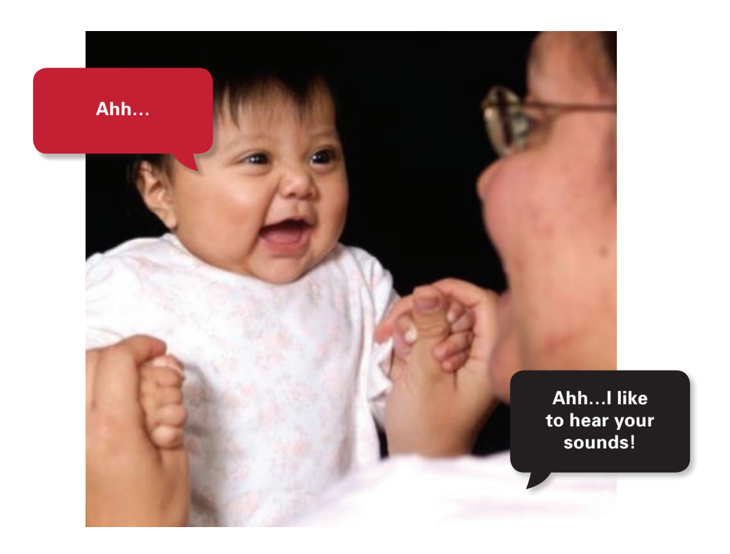
Copy some of her baby sounds back to her!